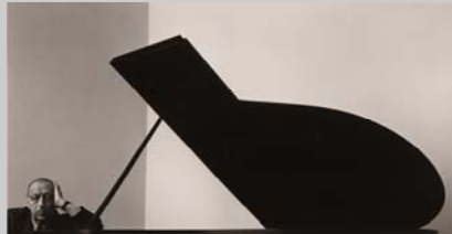
Igor Stravinsky, New York 1946